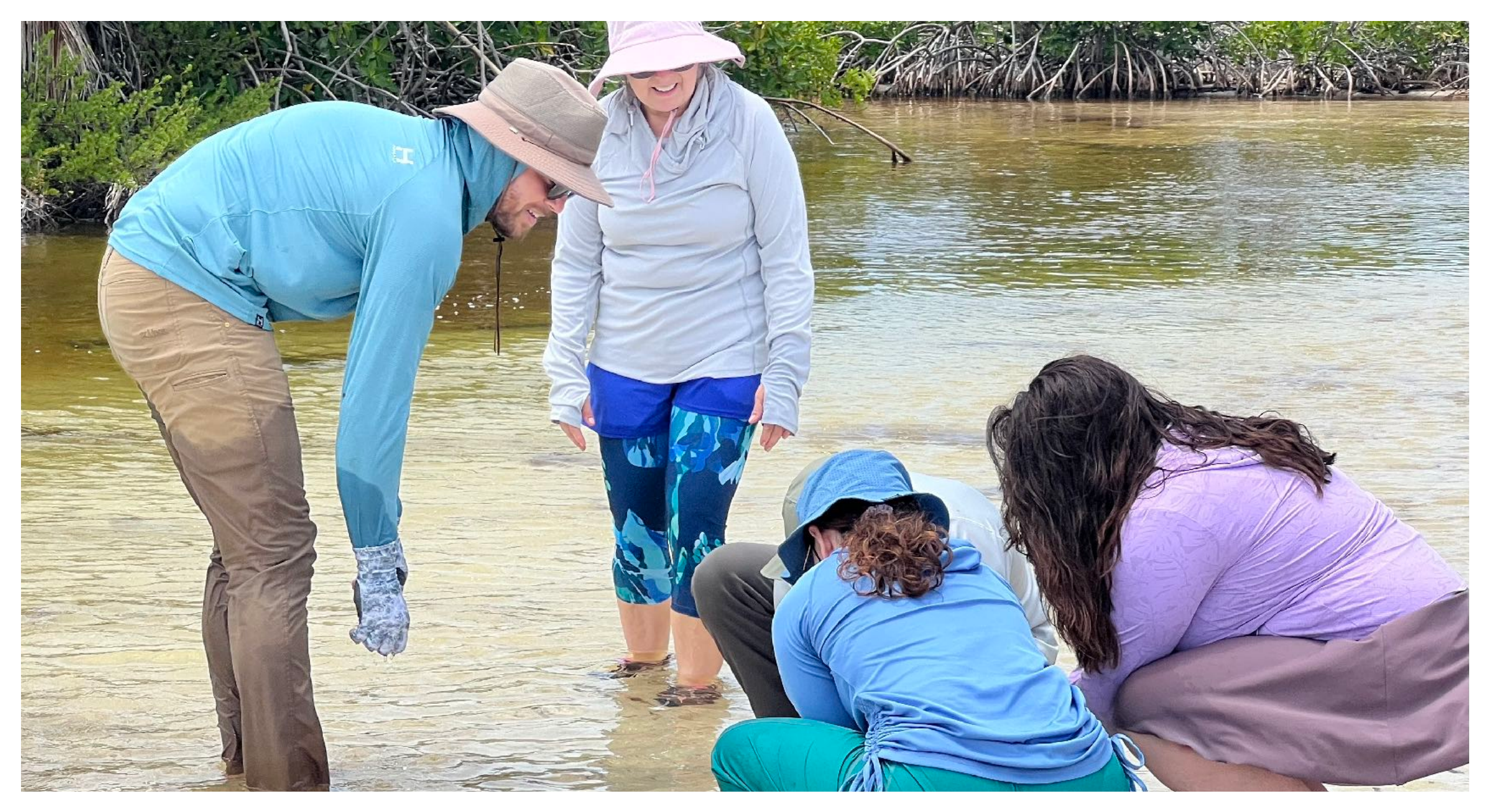
Join our resident biologist in exploring Lighthouse Reef Atoll, Belize.

This is a once in a lifetime opportunity to participate in live field research in a UNESCO World Heritage site. CSI is a curated education experience that cultivates life long learners. This type of emersion impacts lives and forms the character of our future global conservation champions.